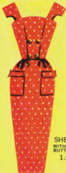
SHEATH WITH GOLD BUTTONS 1.00