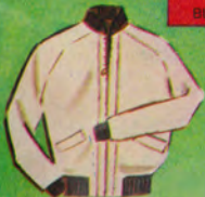
BEIGE WINDBREAKER 1.40