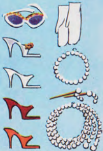
ACCESSORY PAK 1.00