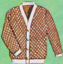
CARDIGAN SWEATER 1.20