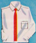
WHITE DRESS SHIRT 1.00