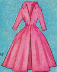
SATIN COAT 1.40