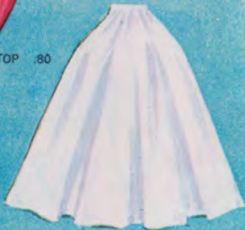
FULL SATIN EVENING SKIRT 1.00

EACH SATIN ITEM SHOWN COMES IN BLACK, WHITE, ROSE AND PINK GLITTER.