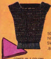
SQUARE NECK SWEATER .80