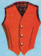
RED VEST .80