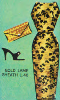
GOLD LAME SHEATH 1.40