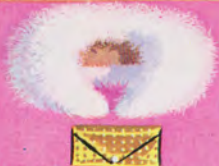
FUR STOLE WITH BAG 1.20