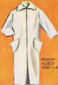
PEACHY FLEECE COAT 1.40