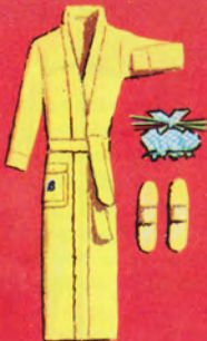
SINGING IN THE SHOWER® 1.40.

COMES IN BLACK & WHITE PRINT, OR 4 SOLID COLORS