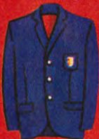
BLUE BLAZER 1.40