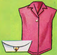
PLAIN BLOUSE .80

COMES IN BLACK & WHITE PRINT, OR 4 SOLID COLORS