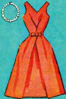
COMES IN 3 COLORS