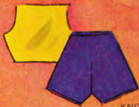
KNIT SHORTS AND TOP 1.00