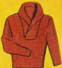
PULLOVER SWEATER 1.00