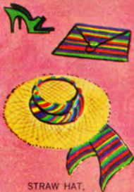
STRAW HAT, PURSE, SHOES 1.00