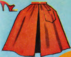
GATHERED SKIRT .80

COMES IN BLACK & WHITE PRINT, OR 4 SOLID COLORS