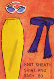
KNIT SHEATH SKIRT AND SASH .80

EACH KNIT ITEM COMES IN MULTI-COLOR STRIPE, AND BLUE, AND YELLOW.