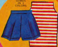
TEE-SHIRT / SHORTS