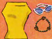
KNIT BLOUSE .80