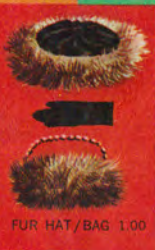
FUR HAT/BAG 1.00