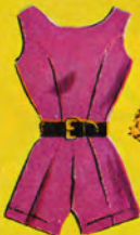
SCOOP NECK PLAYSUIT 1.00

COMES IN BLACK & WHITE PRINT, OR 4 SOLID COLORS