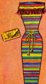
KNIT SHEATH DRESS WITH FRINGED COLLAR 1.20