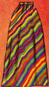
KNIT FULL EVENING SKIRT 1.00