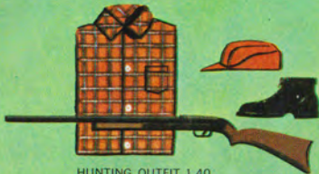
HUNTING OUTFIT 1.40