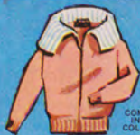
CARDIGAN (ANGORA COLLAR) 1.20 COMES IN 3 COLORS