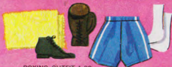
BOXING OUTFIT 1.00