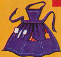
APRON AND UTENSILS 1.00 COMES IN 3 COLORS