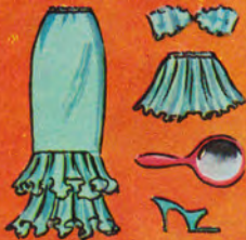
LINGERIE PAK 1.00 COMES IN 4 COLORS