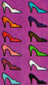
SHOE PAK 1.00