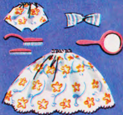
EMBROIDERED SET (LINGERIE) 1.00